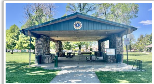
Lions Club Pavilion at Main Street Park.